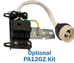
Optional PA12GZ Kit

Description: Aluminium die-cast square downlight featuring twist cap front. Only "C" version is GU10 adaptable. Optional LED available. Material: Aluminium Lamp Base: MR16