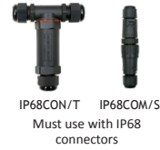
IP68CON/T IP68COM/S Must use with IP68 connectors