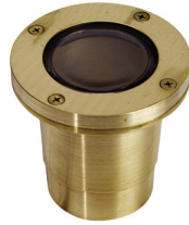
F5050 Solid brass die-cast