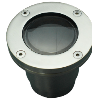
F5060 Stainless Steel