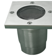
F5062 Stainless Steel