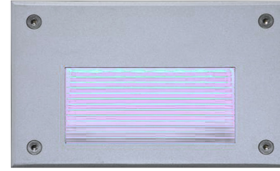
Cool White & Warm White